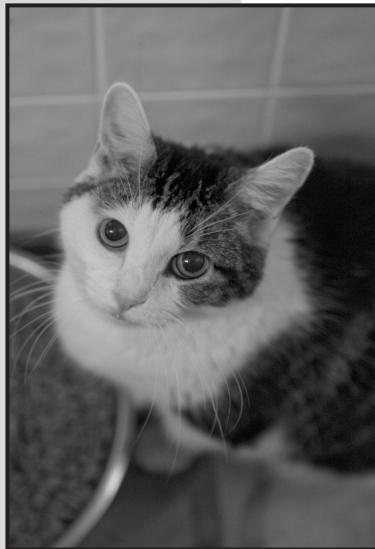
Orphan Annie finally has her own online venue for all of her "catty comments" - visit her at http://www.zelda23publishing.com/indcatsociety