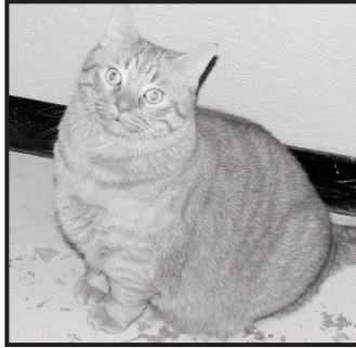
Garfield thanks all of our members for their support!

Please also take a moment to review our revised bylaws, which were also voted in at the November election meeting. The revisions help ensure that our organization can run more smoothly and efficiently, and you can review the changes for yourself at http://www.catsociety.org/about-ics/board-of-directors .