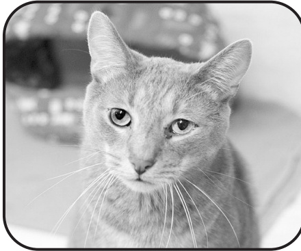
Corky, your Spokescat

"I've got an even better idea. Let's sponsor